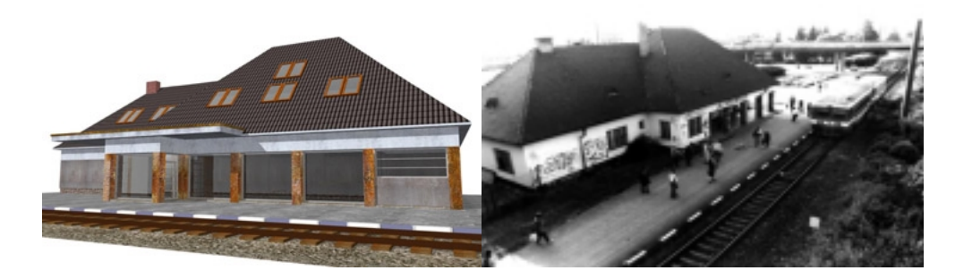
In 2003, Truc spherique has started to transform the old railway station Zilina-Zariecie into the cultural centre Stanica , that is actually under reconstruction process (with estimated budget of 250.000 euros). The aim is to build a multi-media platform, connecting all the activities: creation process in contemporary arts, residential program, performances and gallery room, creative workshops, art therapy and community programs, information centre and internet cafe connected with the original function of the place – the waiting room for passengers.